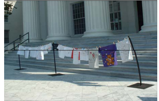
Public Display of the ACADV Clothesline Project